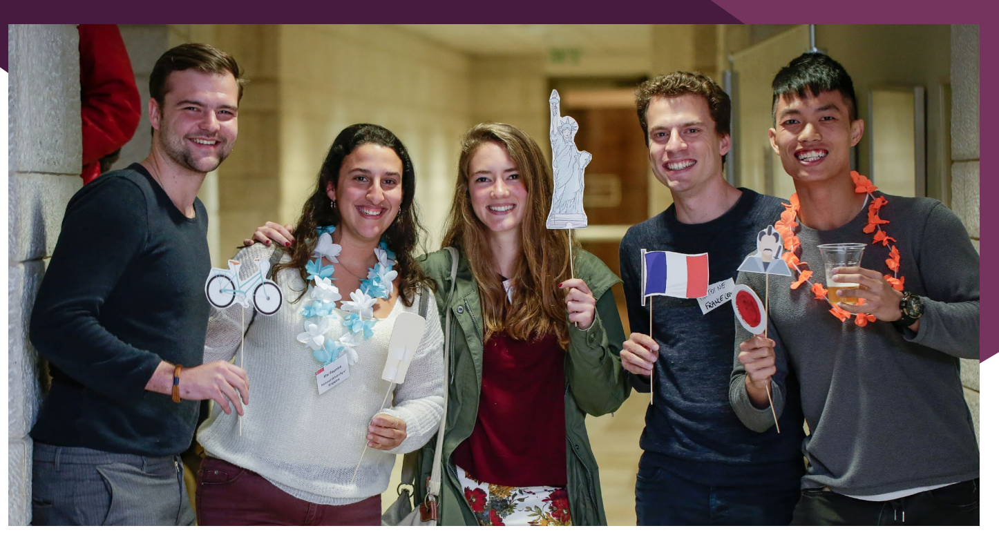
Visit <u>our website</u> for further information on all exchange programs courses.

Incoming exchange students can take a wide variety of undergraduate and graduate level classes (lectures, exercises and seminars) taught in English and Hebrew (conditional on meeting Hebrew Language requirements). Additionally, various university faculties offer clusters (~20 credits of courses) of innovative courses in English, and specially tailored for a duration of 10 weeks. Exchange students can also take courses offered at Rothberg International School (RIS) which offers a wide variety of undergraduate and graduate level classes in English.