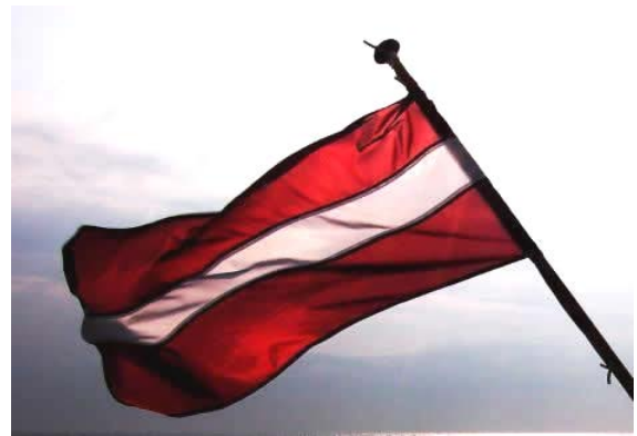
On national holidays, Latvian flag is displayed outside houses.

January 1 - New Year's Day (Jaungada diena) March 29, 2013 – Good Friday (Lielā piektdiena) March 31, 2013 - Easter Sunday (Lieldienas) April 1, 2013 - Easter Monday (Otras Lieldienas) May 1 - Labour Day (Darba svētki) May 4 – Independence Restoring Declaration Day (Neatkarības pasludināšanas deklarācijas diena) June 23 & 24 - Midsummer celebrations (Līgo & Jāņi) November 18 - Independence day December 24, 25, 26 - Christmas (Ziemassvētki) December 31 - New Year's Eve (Vecgada vakars)