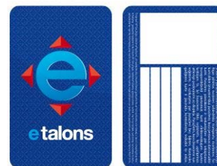
Monthly student ticket

ERASMUS students have a right to receive a transport discount. In order to apply for it, you should request a confirmation of your student status from the Mobility Centre and apply with it for your personalised E-ticket at one of Rīgas satiksme Service centres ( http://etalons.rigassatiksmel.lv/en/service_centres ).