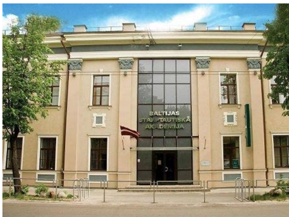
Building Lomonosova 1 (L-1)

Baltic International Academy is situated in two buildings – Lomonosova 1 and Lomonosova 4.