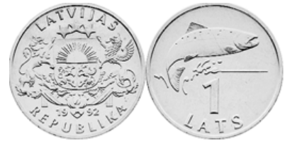
1 lat coin

Most of the shops, restaurants, hotels in the major towns accept credit cards, but if you travel to provincial towns, better take sufficient amount of cash with you.