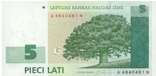
5 lats banknote

Most of the shops, restaurants, hotels in the major towns accept credit cards, but if you travel to provincial towns, better take sufficient amount of cash with you.