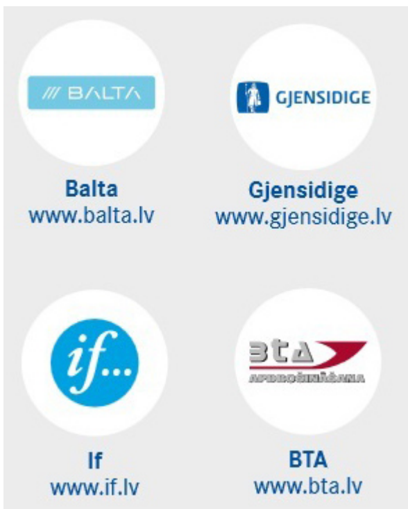
Some insurance companies in Latvia

Please e-mail your questions to our visa department: visa@bsa.edu.lv .