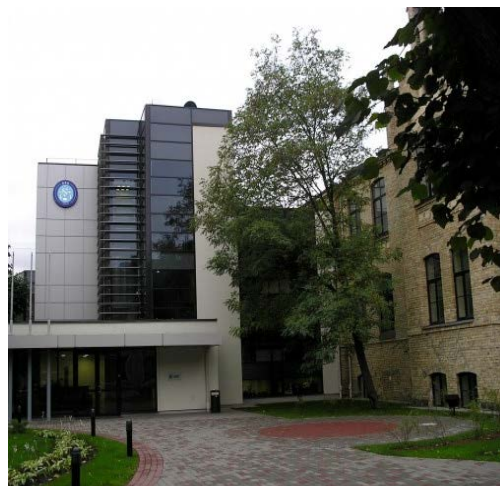
Building Lomonosova 4 (L-4)