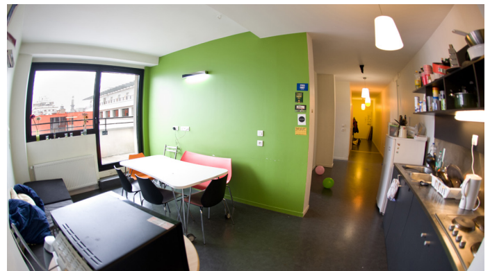
Shared apartment at the Maison des étudiants (CROUS)

+ www.crous-grenoble.fr/demanderunlogement/ http://www.crous-grenoble.fr/demanderunlogement/logement-etudiant-international/