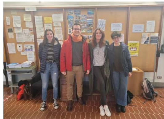
UNIFI Team for 2022