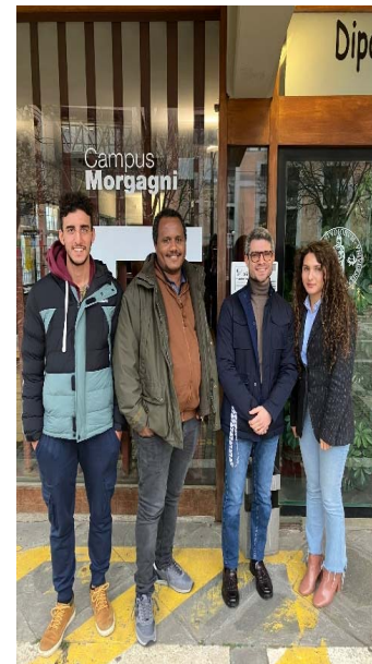
UNIFI Team for 2023