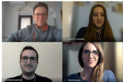
UNIFI Team Econometric Game 2021