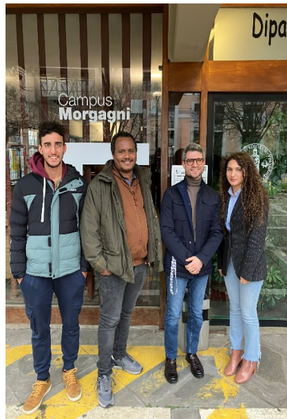
Our Team year 2023