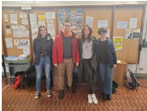
Our Team year 2022