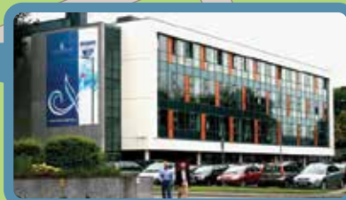
J.E. Cairnes School of Business and Economics