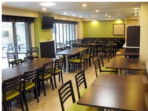
Common dining hall 食堂