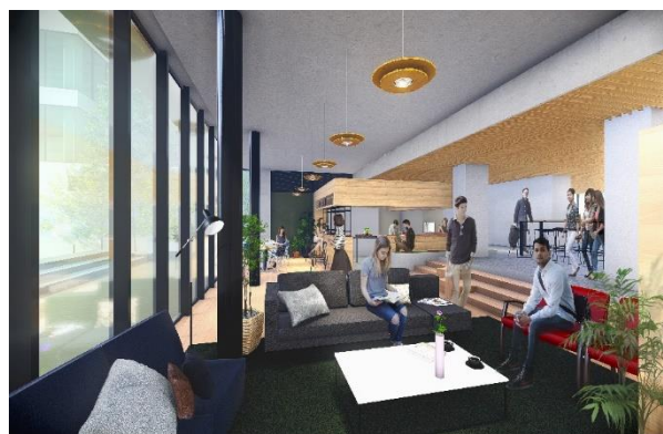
Common living room (image)共有リビング(イメージ)