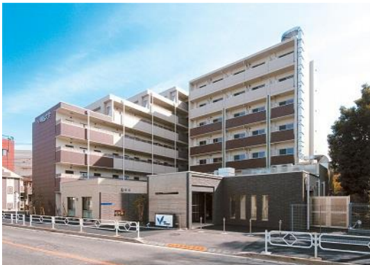
Exterior of the building 外観